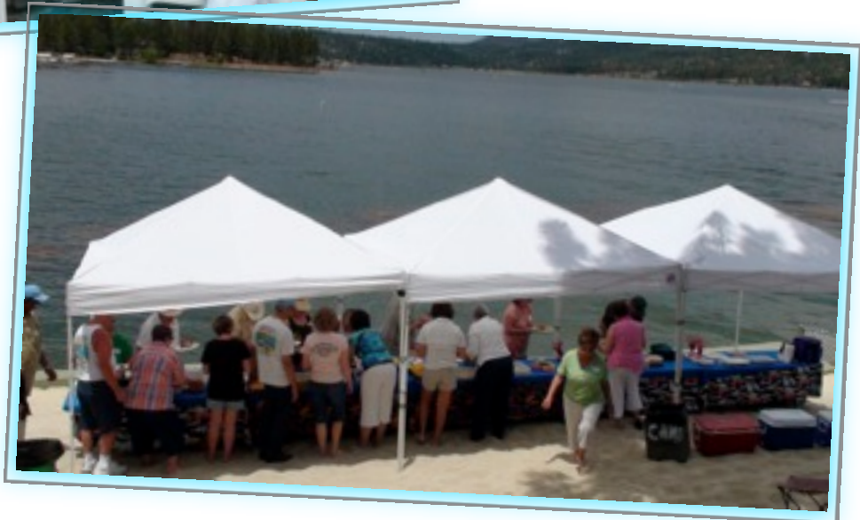
It was a warm and sunny day on the beach, nice clean sand! Everyone brought their favorite dish, and lots of desserts too! A very fun day!