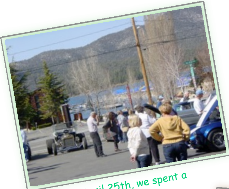
On April 25th, we spent a beautiful warm day at Nottinghams. The lake view was a welcomed sight after all of the snow!

On the last day of April, the Pinewood Derby begins! Club members distribute the car kits to all three elementary schools.