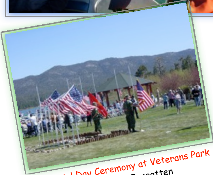
Memorial Day Ceremony at Veterans Park You Are Not Forgotten