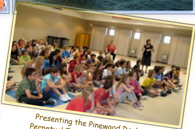
Presenting the Pinewood Derby Perpetual Trophy to the students of Baldwin Lane Elementary!