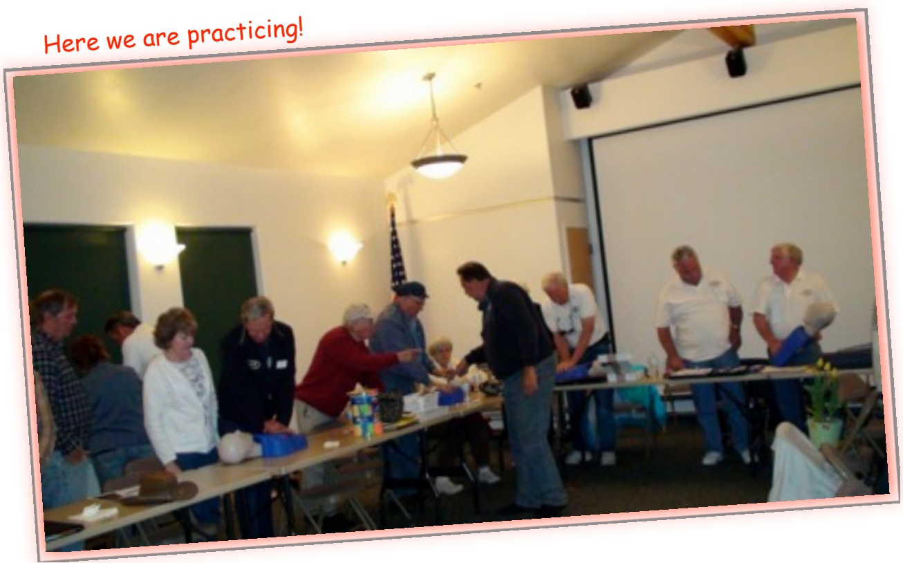
Here we are practicing!