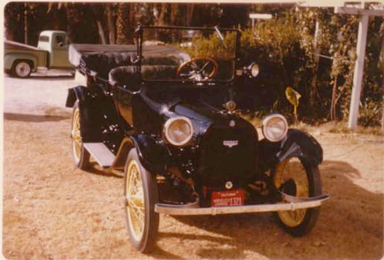
CHUCK LAWERNCE 1916 DODGE