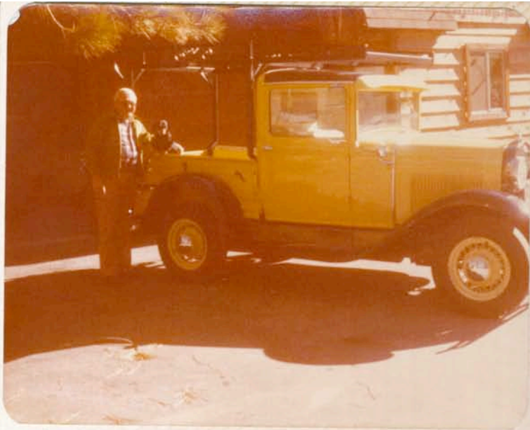
ED & MAIRIE CLOSED CAB PICK UP