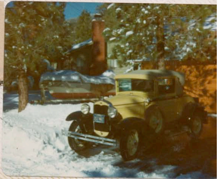
ED & MAIRIE 31 MODEL A SPORT COUP

The meeting will be at Chuck Lawrence's Oak Knoll