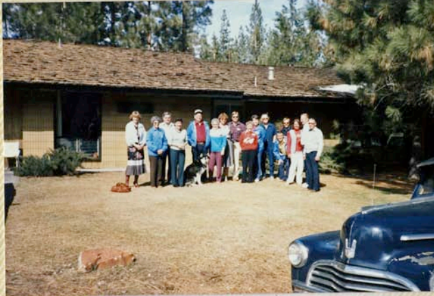
YEAGER'S - VALENTINE'S 85 ↑