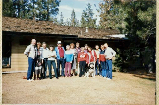
↓ THELMA'S - BREAKFAST - 3-85 ST. PATRICK'S DAY