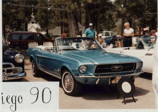
San Diego 90