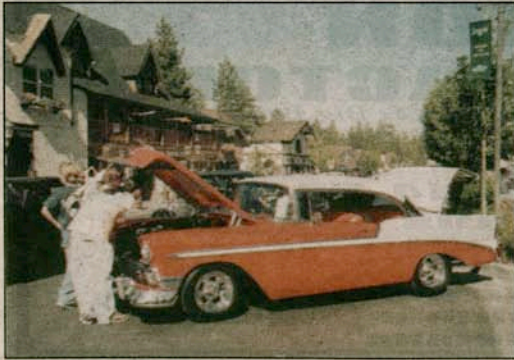
Pictured are previous Fun Run entrants.